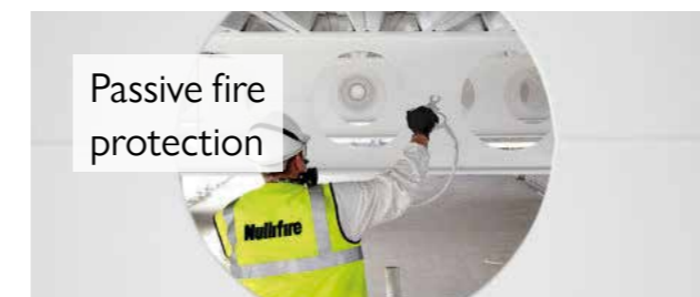
Passive fire protection

Window Insulation, Façade Construction, Exterior Insulation & EIFS, Structural & Inplant Glazing