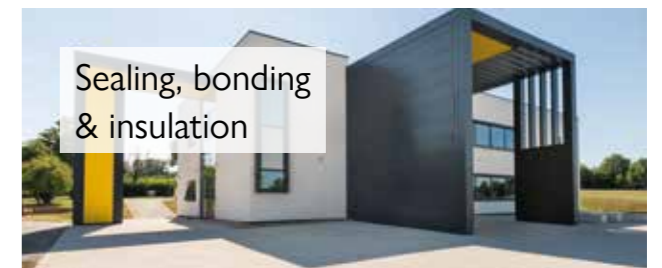
Sealing, bonding & insulation

The product brands housed within CPG Europe cover a wide array of different construction needs and provide a wealth of complex services, support and systems that are rarely found together under one roof.